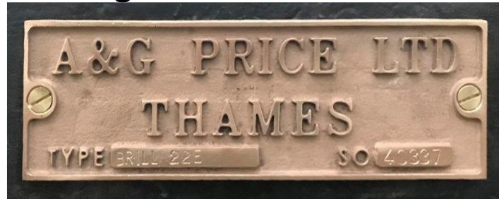
Builder plate for the world's newest Brill 22E truck