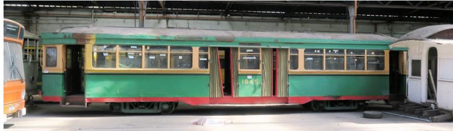
After many years in Victoria, Sydney R class 1845 has returned to NSW where it is in storage for Sydney Tram Museum